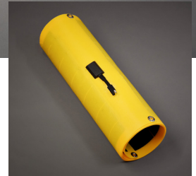
Saffron (Yellow) PN 20107S