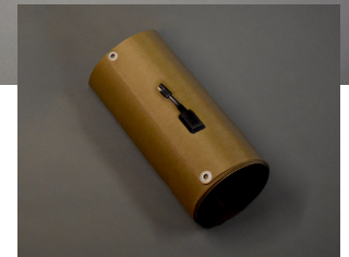
Coyote (Brown) PN 21137